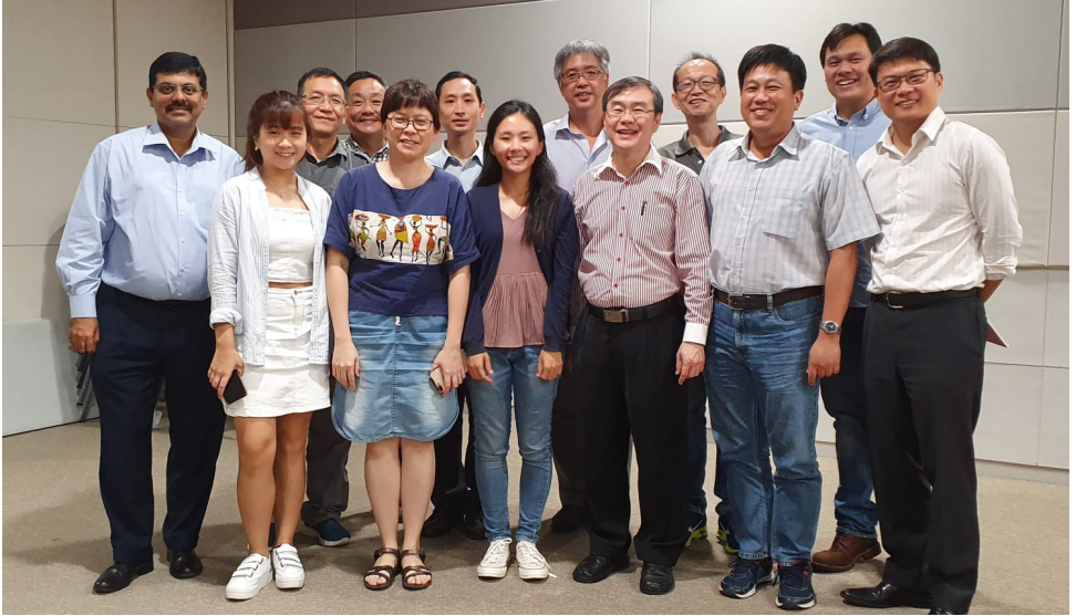
Christianity Explored Table Hosts

Reflections from recent Christianity Explored (CE) Participants held on Jan/Feb 2020: